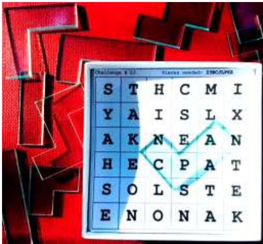
LEGEND for 12 unique acrylic Tetromino Puzzle Shapes:

A solitaire word search brainteaser with endless challenges to boggle your mind.